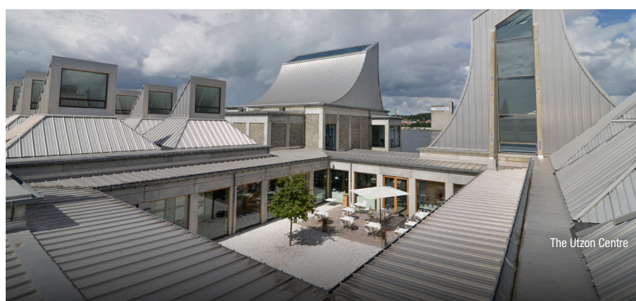
The Utzon Centre

Meals: B L D Hotel: Admiral Hotel, Copenhagen